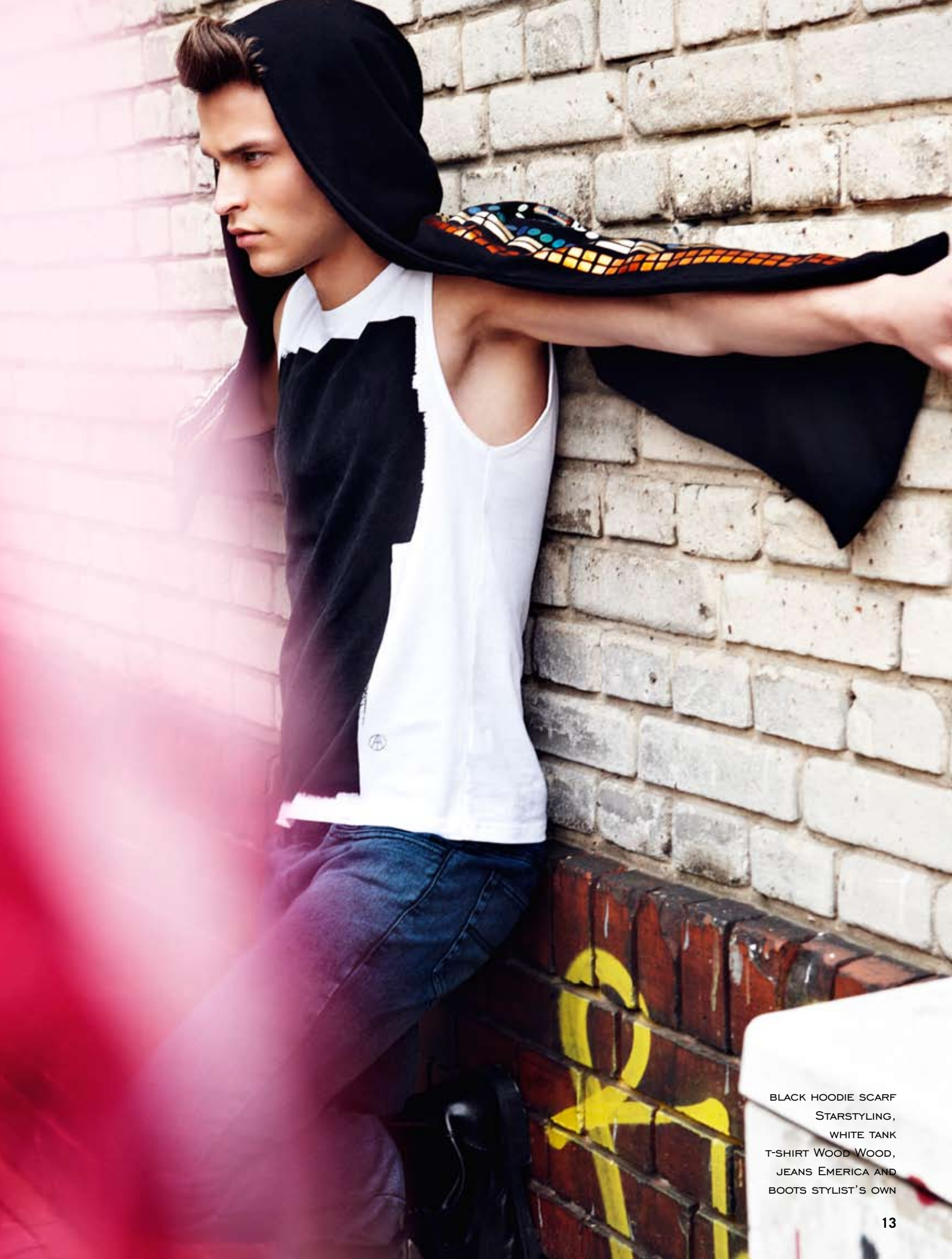
BLACK HOODIE SCARF STARSTYLING, WHITE TANK T-SHIRT WOOD WOOD, JEANS EMERICA AND BOOTS STYLIST'S OWN