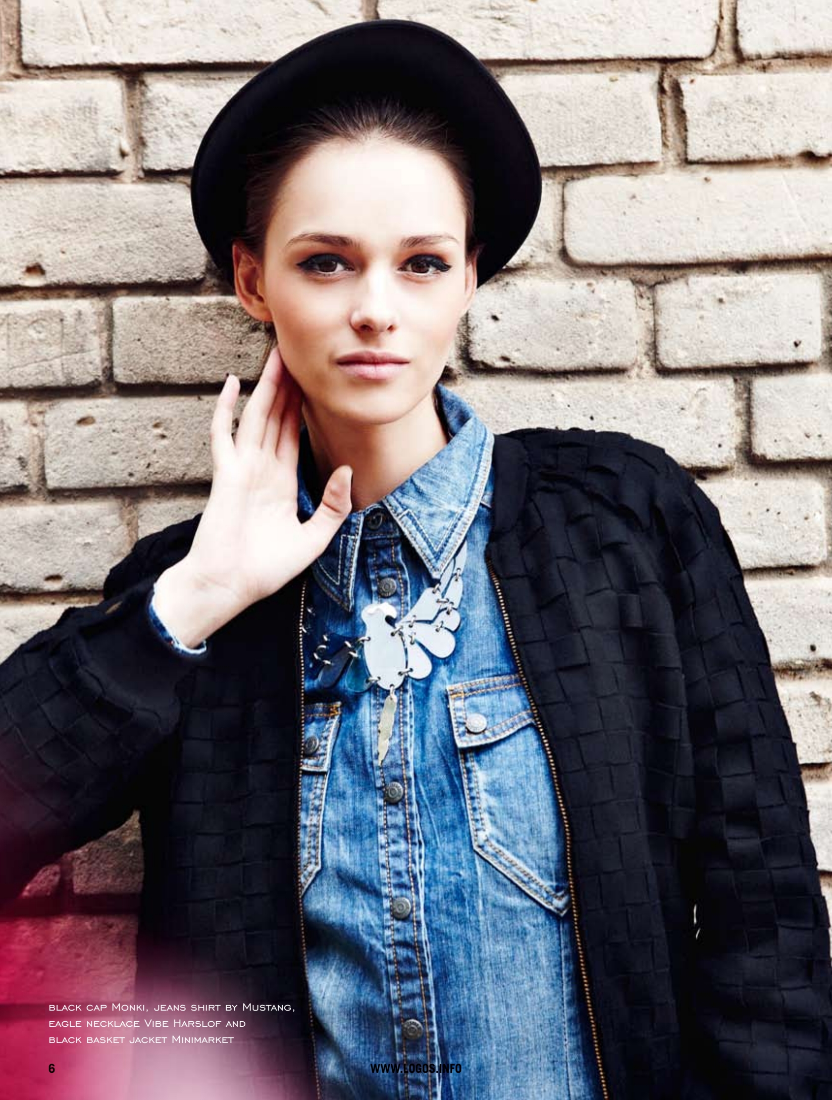
BLACK CAP MONKI, JEANS SHIRT BY MUSTANG, EAGLE NECKLACE VIBE HARSLOF AND BLACK BASKET JACKET MINIMARKET